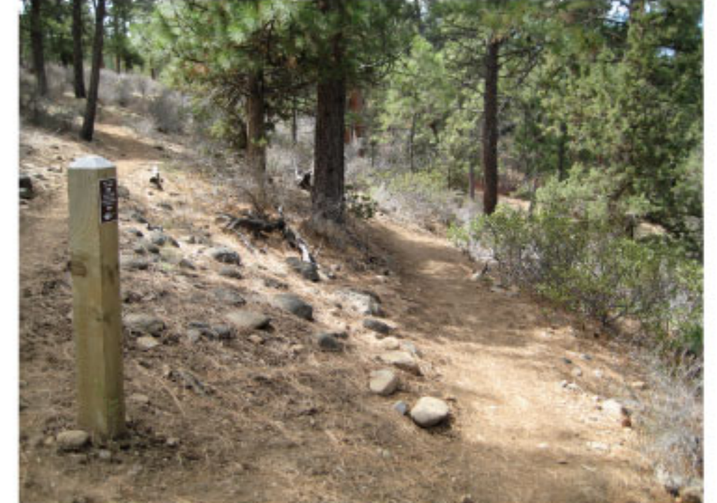
INTERMEDIATE SOFT SURFACE TRAIL STEEP & NARROW