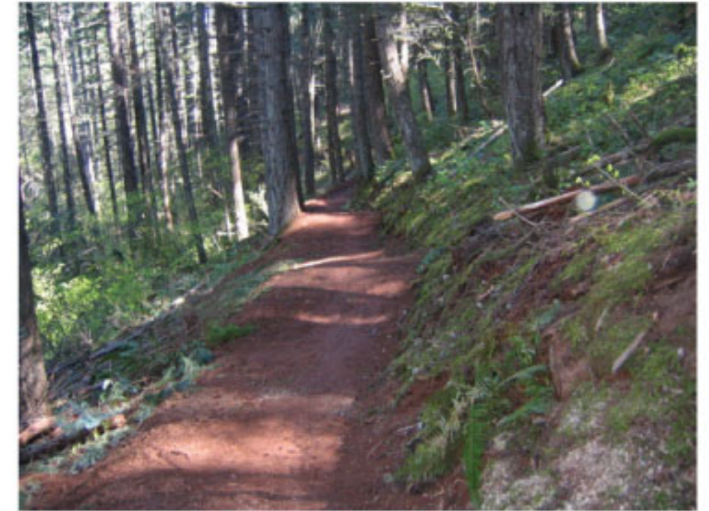
BEGINNER SOFT SURFACE TRAIL