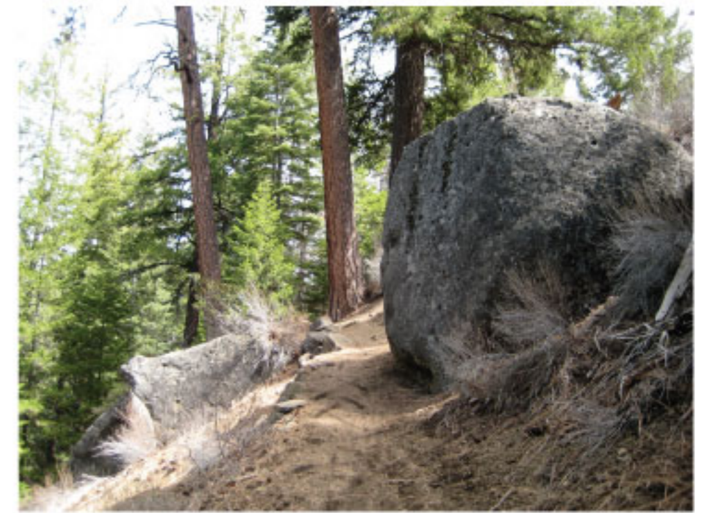
ADVANCED SOFT SURFACE TRAIL VERY STEEP & NARROW