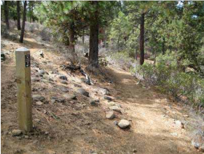
Intermediate soft surface trail