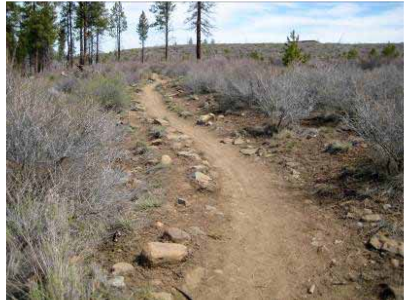
Beginner soft surface trail