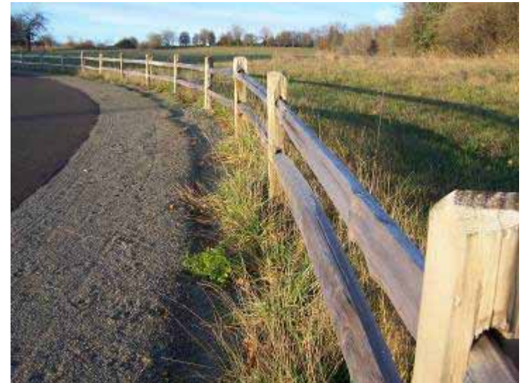
Split Rail Fence