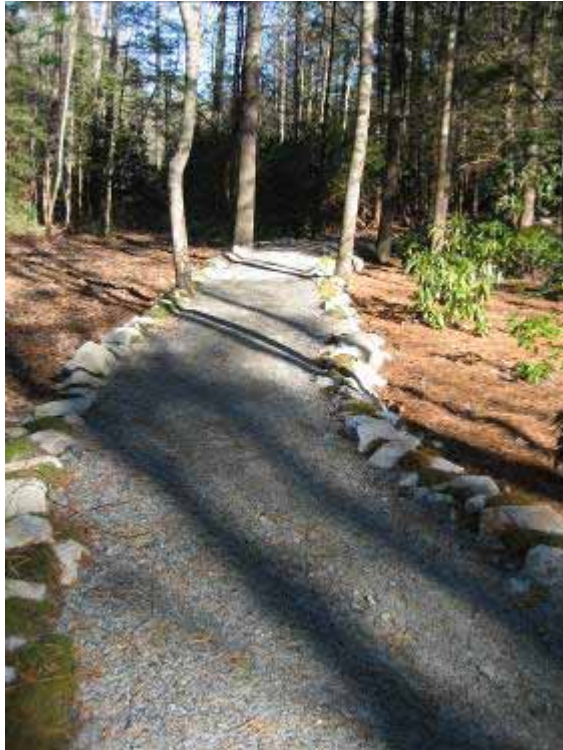
Natural surface accessible trail