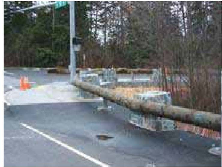
Rustic Log Barrier