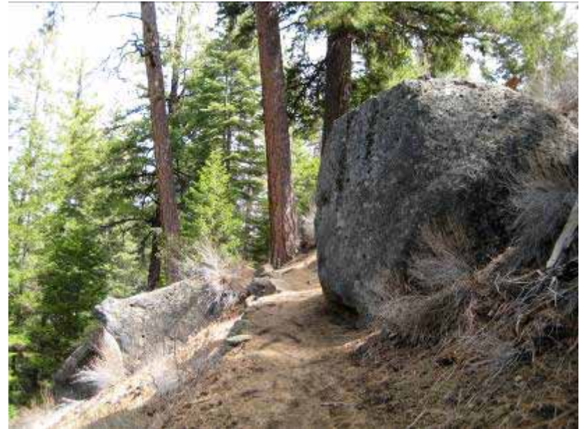
Advanced soft surface trail