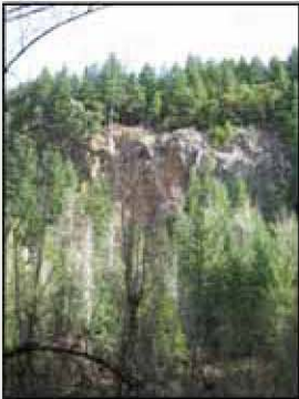
4 Rock wall face as viewed from the clearing below