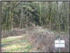
3 Entry road