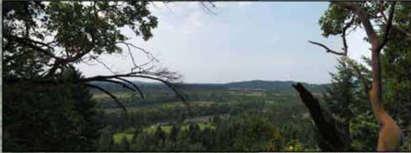
5 The top of the wall provides views of Clackamas River and beyond