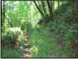
1 An existing, overgrown roadbed leads to a high point.