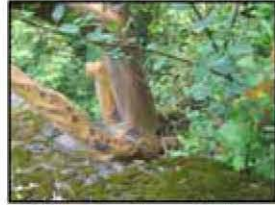
6 Slings hung from a Madrone at the top of the wall