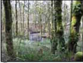
2 Wetlands border the western property line.