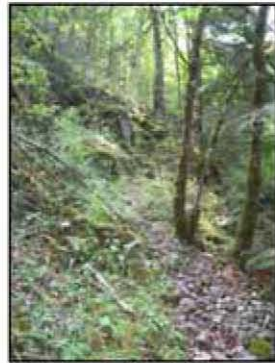
7 A steep trail leads to the top of the wall