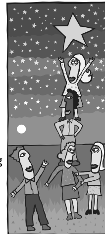
Ongoing support is especially important for people with thought disorders and their families.

The program begins with a day-long workshop for individuals and their family members. Families can include parents, siblings or other relatives or significant others, friends or anyone the individual considers part of his/her primary support network. During this group workshop with other individuals and families dealing with thought and/or thought/mood disorders, families learn important information about schizophrenia and schizoaffective disorder, such as: