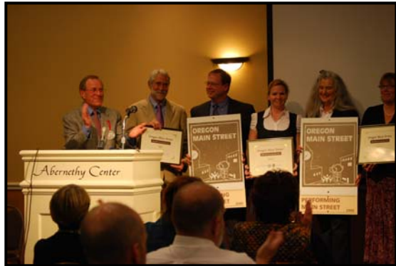
Performing Main Street Oregon City