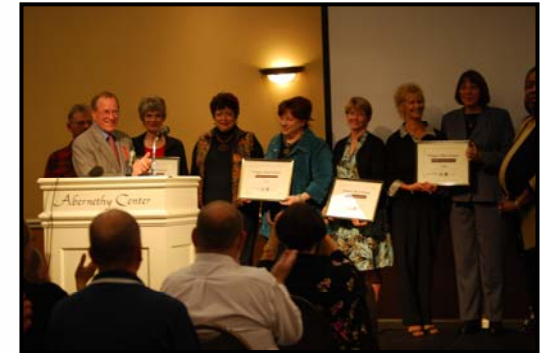
Transforming Downtown Sandy