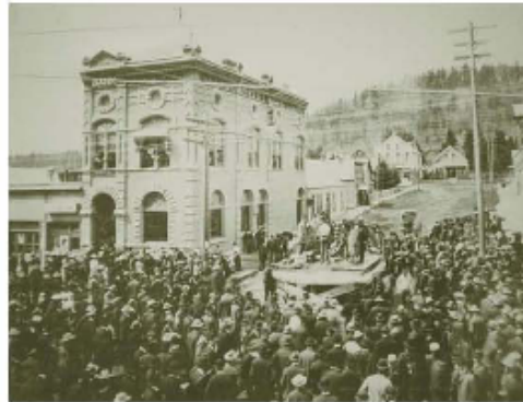
Performing Main Street Transforming Downtown